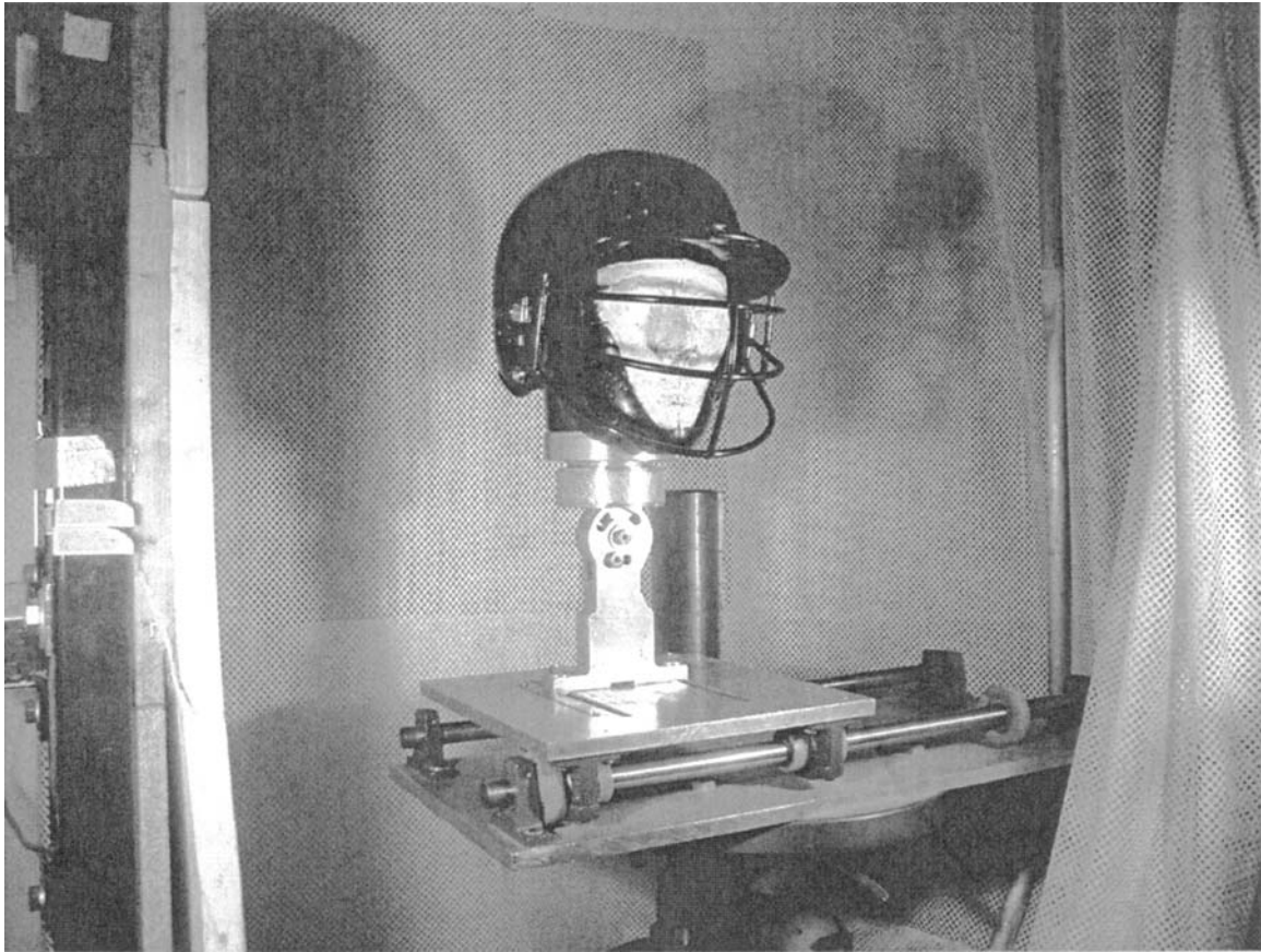
FIG. 1 Face Guard and Helmet on Headform